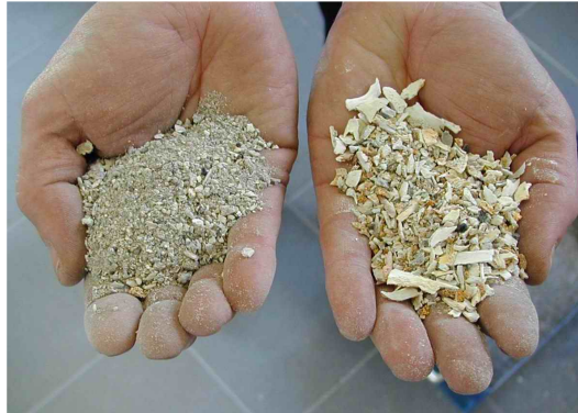
Results of the animal remains processor at the left. At the right the results of another processor.

After cremation of the animal, rough ashes remain. For the strewing of the ashes, or for the keeping in an urn, further processing of the ashes is required. For this purpose, we have the Animal Remains Processor. This device reduces the size of the ash particles in such a way that strewing or collection in an urn can properly be done.