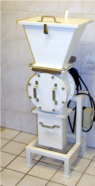
Animal remains processor

After cremation of the animal, rough ashes remain. For the strewing of the ashes, or for the keeping in an urn, further processing of the ashes is required. For this purpose, we have the Animal Remains Processor. This device reduces the size of the ash particles in such a way that strewing or collection in an urn can properly be done.